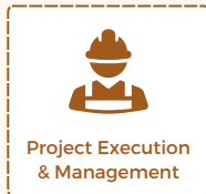
Project Execution & Management