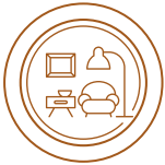
Interior Designs and Execution