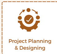
Project Planning & Designing