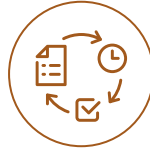
Complete Project Management