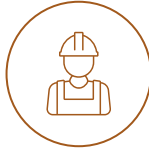
Builders and Developers