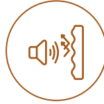
Sound Proofing, AMC & ACP