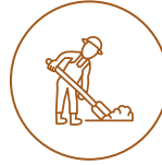
Landscaping & Softscaping