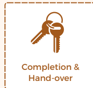
Completion & Hand-over