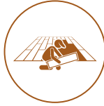
Industrial Epoxy & PU Flooring